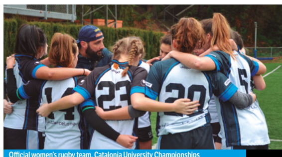
Official women's rugby team. Catalonia University Championships