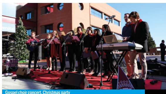
Gospel choir concert. Christmas party

In UIC Barcelona we promote and organise sports activities and competitions, and we provide discounts and special conditions for access to sports facilities to keep you in shape and live healthier lives. During the course, we organise charitable activities in cooperation with multiple institutions and advise regarding volunteer work. You can take an active part in #UICSocialDay a day on which the whole University comes together to help those most in need. You can also form part of theatre, debate, painting and music groups, which foster the cultural side of UIC Barcelona and help you acquire more skills and values.