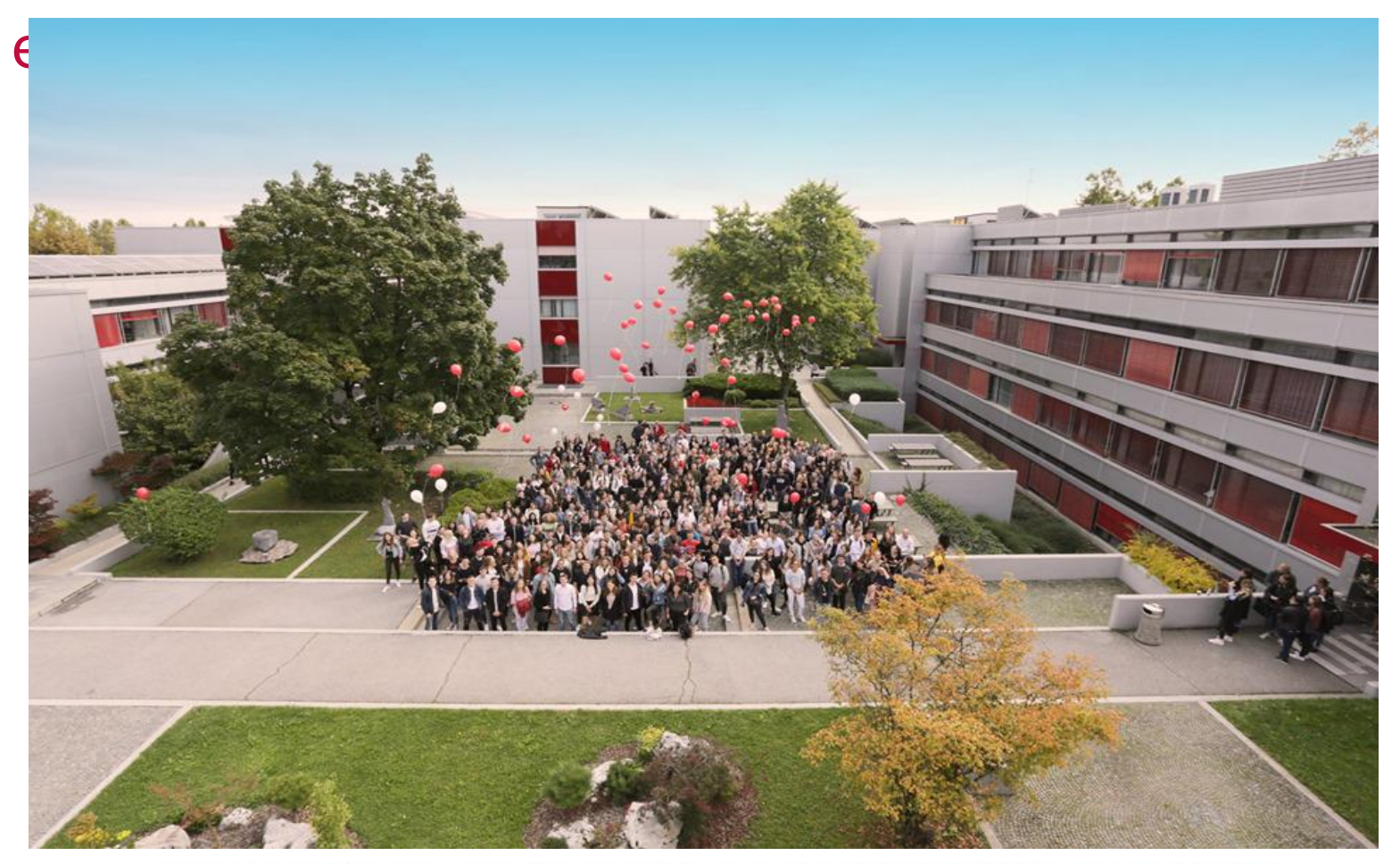
University of Ljubljana SCHOOL OF ECONOMICS AND BUSINESS

More than 1000 international students represented across campus - great international study environment with cross-cultural learning