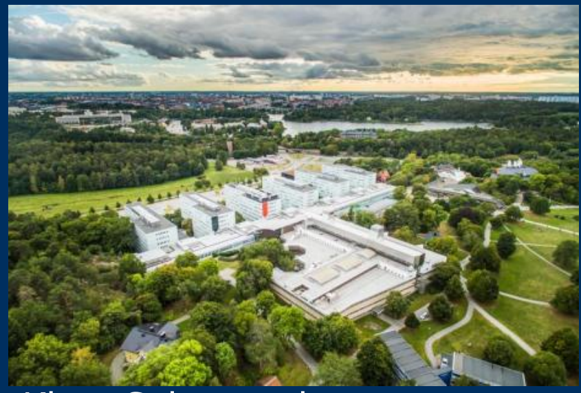
Kista Science city