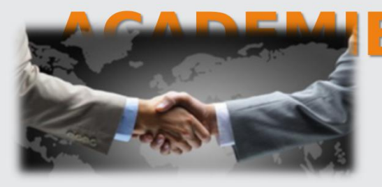
Faculty of Public Governance